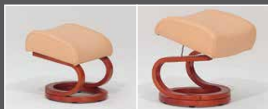
Illustrated example: Height-adjustable footstool