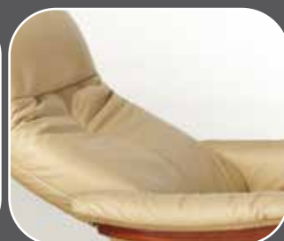
The specially designed lumbar support permits healthy, relaxed sitting