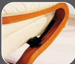
Using the grips positioned on both sides, the stiffness of the mechanism can be adjusted