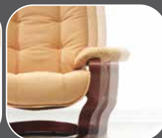
Personal wellbeing and maximum seating comfort with 3 different seat widths