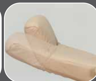
Sitting, reading, relaxation - the variable headrest can be individually adjusted to your preferred position