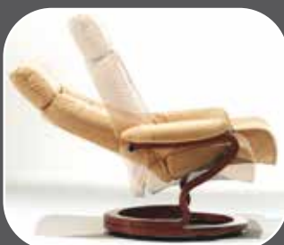
Glide steplessly and gently into the ideal relaxation position with outstanding ease