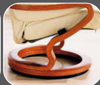
Stable sub-frame in high-grade beech, available in a range of different colours