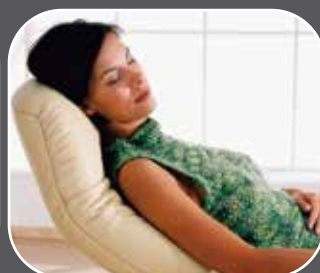
The flexible headrest automatically adjusts to your sitting position