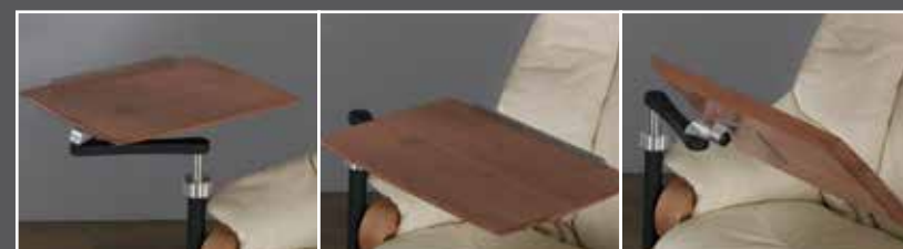
matching laptop table