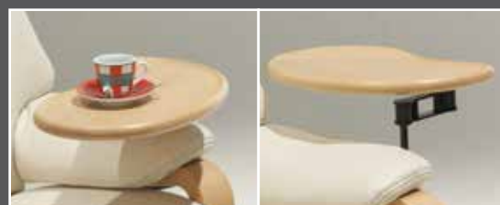
matching swivel table