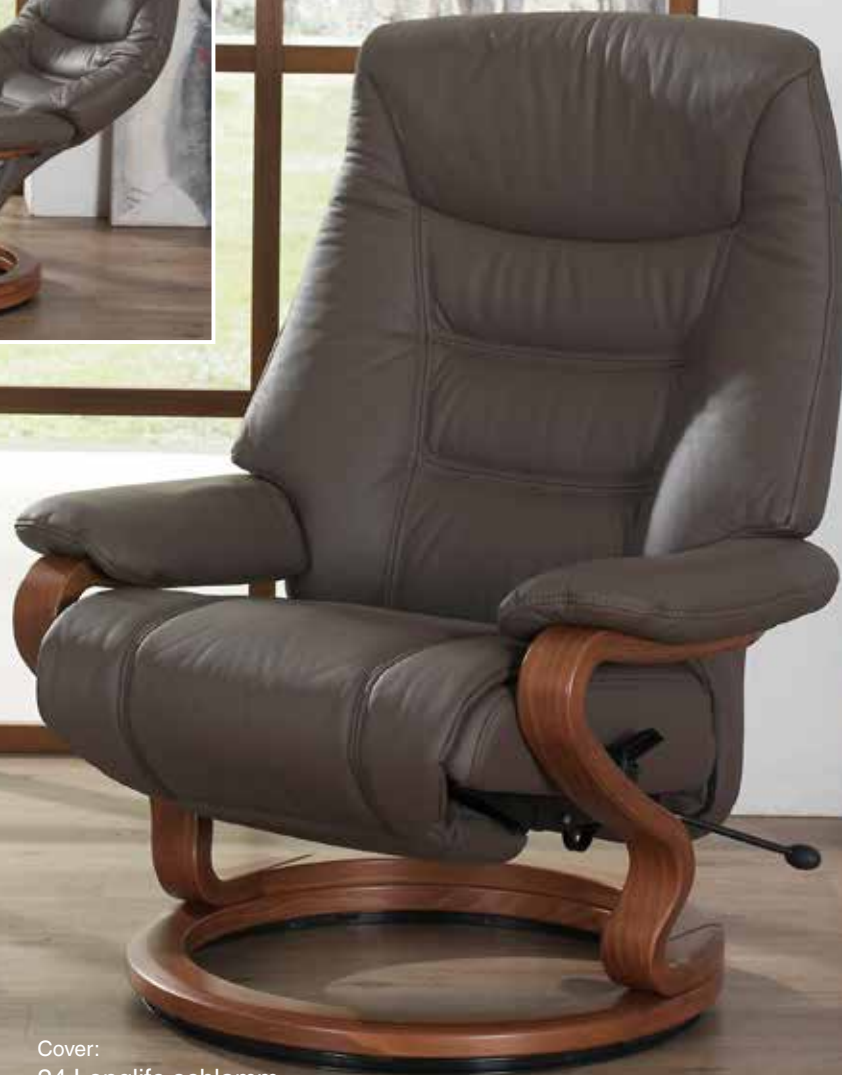
Cover: 24 Longlife schlamm