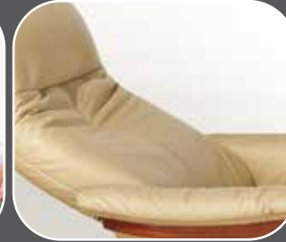
The specially designed automatically adjusts to your lumbar support permits healthy, relaxed sitting