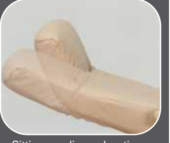
Sitting, reading, relaxation the variable headrest can be individually adjusted to your preferred position