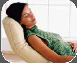
The flexible headrest sitting position