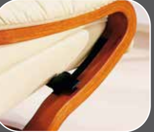
Using the grips positioned on both sides, the stiffness of the mechanism can be adjusted